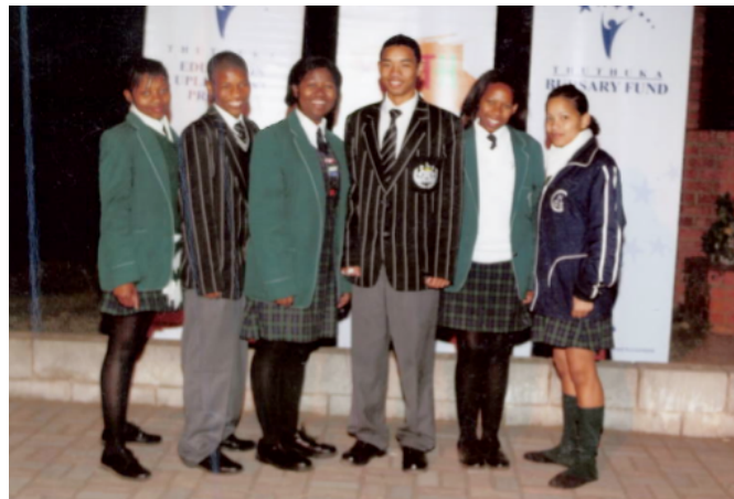
East London students at mathematics camp.

We are proud to have established this relationship with SAICA and we hope it will grow to great lengths.