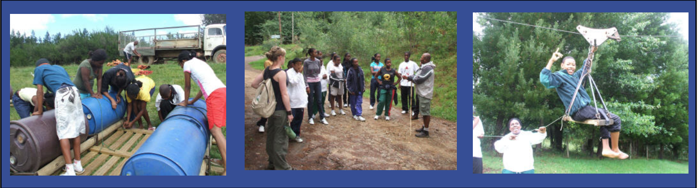
Eastern Cape students at Orientation Camp