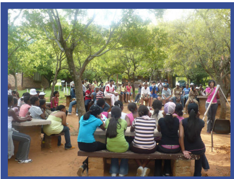
Johannesburg students at Orientation Camp

Students reported after the camp that they valued the skills they learnt and the relationships they formed. Many said the camp had assisted them in facing and overcoming their fears and believed they could contribute as a support system to overcome challenges at their respective schools.