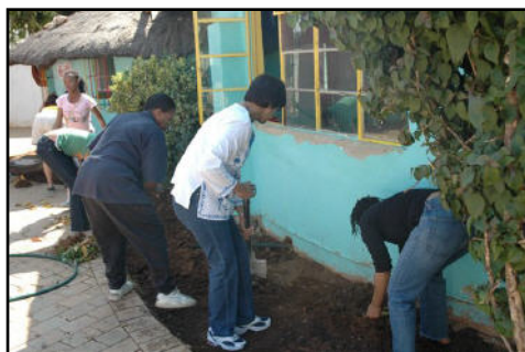
Mentors and mentees preparing soil for planting flowers.