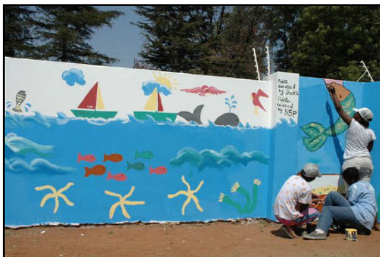
A mural painted by SSP mentors and scholars at the New Jerusalem Children's Home.