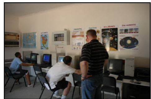
Information Resource Centre programming in action.